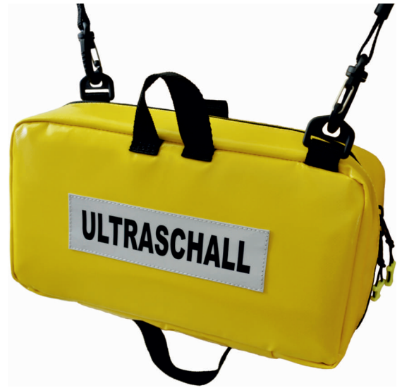
Bag for ultrasound device brilliantyellow: 6980400

Size: approx. 32x17x9,5cm Weight: approx. 700g with inside pockets Volume: approx. 5L Material: robust material: Rocktarp 680, YKK zipper