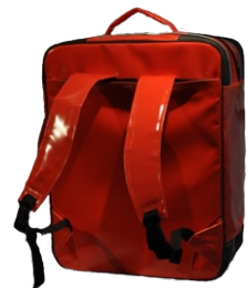
Plain and disinfection-friendly back