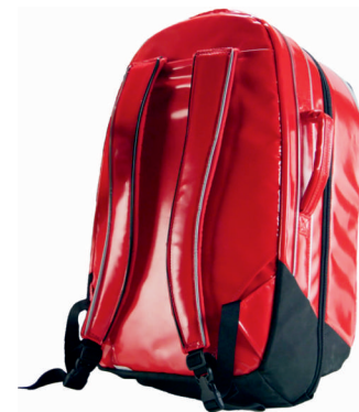
Plain and easy to clean material

Size: approx. 57x35x29cm, with regular package approx. 58x37x38cm