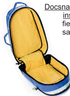
Docsnake 48 TCX without inside pockets: fieryred: 775100 saphierblue: 775120

Material: robust and easy to clean: Rocktarp 680, Rocktarp 210, Antislip 680, Duraflex clasps, YKK zipper